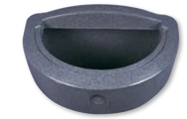
Non Recyclables open top