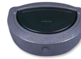
Non Recyclables swing top